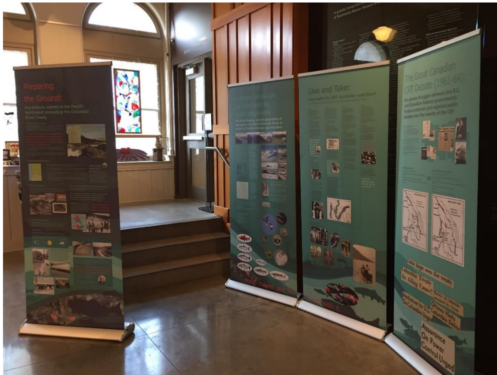
2- Installation view